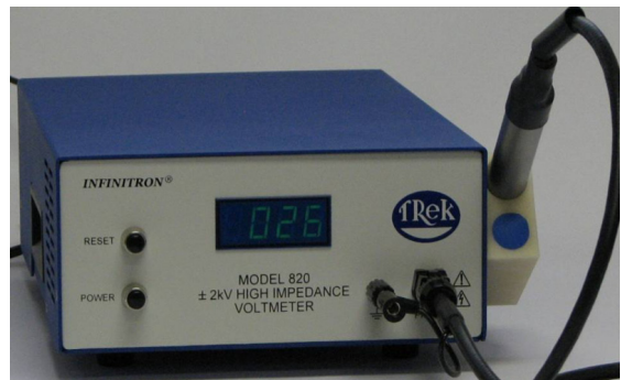
Figure 5: Probe holder shown at right

It is interesting to note that during normal operation, when using the hand-held probe, as the probe approaches the surface being measured, the Model 820 will indicate the voltage level of the measured surface even before actual contact is made. This occurs due to the virtual zero input capacitance of the probe in relation to the high capacitive coupling between the probe and test surfaces just before contact is made.