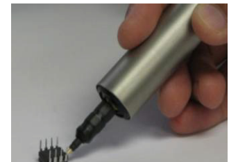
Figure 1: IC Pin Voltage Measurement

For example, if an ordinary voltmeter is used to measure the charge associated with a pin of an IC chip, when the instrument makes contact with the pin, all of the charge associated initially with this pin will be removed. As a result, the voltage indicated would be erroneous (the voltmeter will indicate 0 volts). However, the Model 820 can measure the pin voltage without discharging or affecting its voltage.