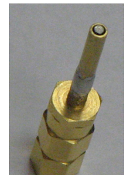
Figure 2: Probe Tip

Figure 2 shows a probe tip that can be used for scanning purposes. Figure 3 shows a test plate with strips alternately connected to a voltage source and ground. The probe was mounted at a distance of 500 μm from the plates. The voltage monitor output of the unit was connected to an oscilloscope. The waveform of the voltage measured by the voltmeter when the probe scanned the test plate from left to right is shown.