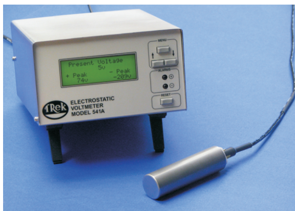
Model 541A with Probe

The electrostatic charge and the ability for charge accumulation of a person walking on an ESD safe floor with ESD safe footwear can be measured with a walking test adapter. This test, in addition to data from standard resistance measurements, provide measurement data on the actual charge on a person while walking. This test ensures ESD safe practices are being implemented properly and that charge is being maintained under the maximum allowed voltages (typically less than 100V as per ANSI/ESD S20.20-2007, IEC 61340-5-1:2007, and IEC 61340-5-2:2007)