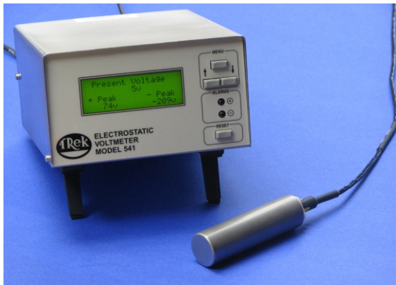
Model 541 with Probe

The electrostatic charge and the ability for charge accumulation of a person walking on an ESD safe floor with ESD safe footwear can be measured with a walking test adapter. This test, in addition to data from standard resistance measurements, provide measurement data on the actual charge on a person while walking. This test ensures ESD safe practices are being implemented properly and that charge is being maintained under the maximum allowed voltages (typically less than 100V as per ANSI/ESD S20.20-2007, IEC 61340-5-1:2007, and IEC 61340-5-2:2007)